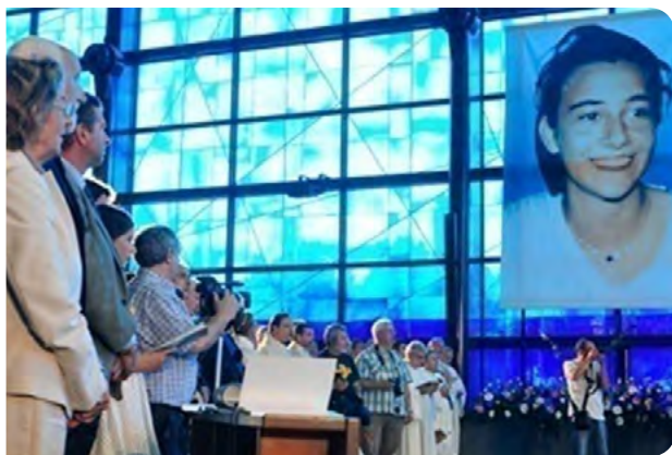
During the Beatification Celebration, September 2010

FOR MORE INFORMATION ON BLESSED CHIARA LUCE BADANO , VISIT www.chiaraluce.org