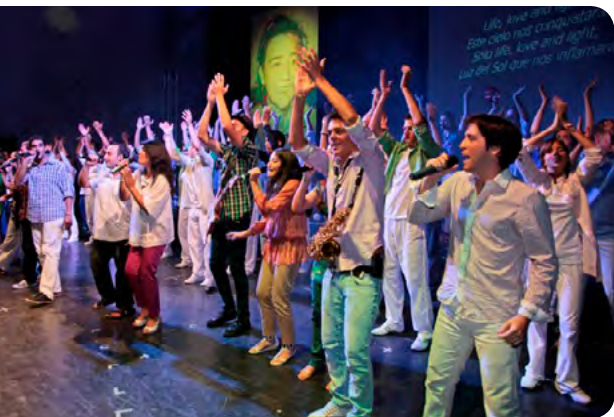
Chiara Luce Musical presented at World Youth Day 2013

I felt as if I had known the other Gen forever! We had such a great time sharing our experiences, reflecting on the topic of this Ideal year – reciprocal love – but also eating, playing and laughing. I'd brought a script of the musical about Chiara Luce that the Teens for Unity of my province in Italy are performing all around the region– it's such a beautiful musical! I wanted to show it to the other Gen. And our Gen assistant brought an edition of Living City magazine for me. I was