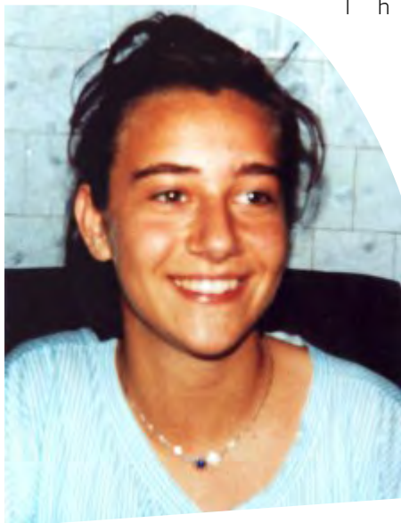
Blessed Chiara Luce Badano

teacher was extremely surprised, but she let me read. After I finished, she was so moved by Chiara Luce's beautiful life that she asked me to repeat her name so that everybody could “Google” it. Wow! The next day, I went to Mariapolis Luminosa for a Gen meeting to start off the year. Everything was new, but soon