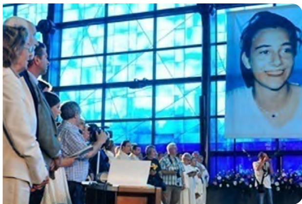
During the Beatification Celebration, September 2010

FOR MORE INFORMATION ON BLESSED CHIARA LUCE BADANO , VISIT www.chiaraluce.org